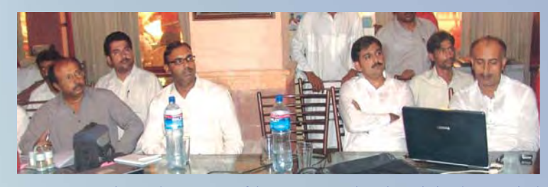
Speakers and participants of the seminar on Indigo plant, Shaheed Benazirabad

Speakers at a seminar urged the government to help revive indigenous Indigo plant locally called Neer in Sindhi, which is national heritage.