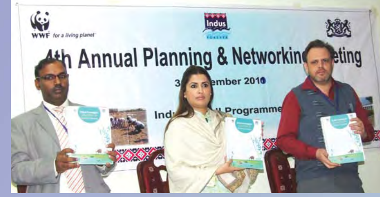
Launching of the environmental education kit

4th Annual Planning & Networking Meeting Held 9th Indus Ecoregion Steering Committee