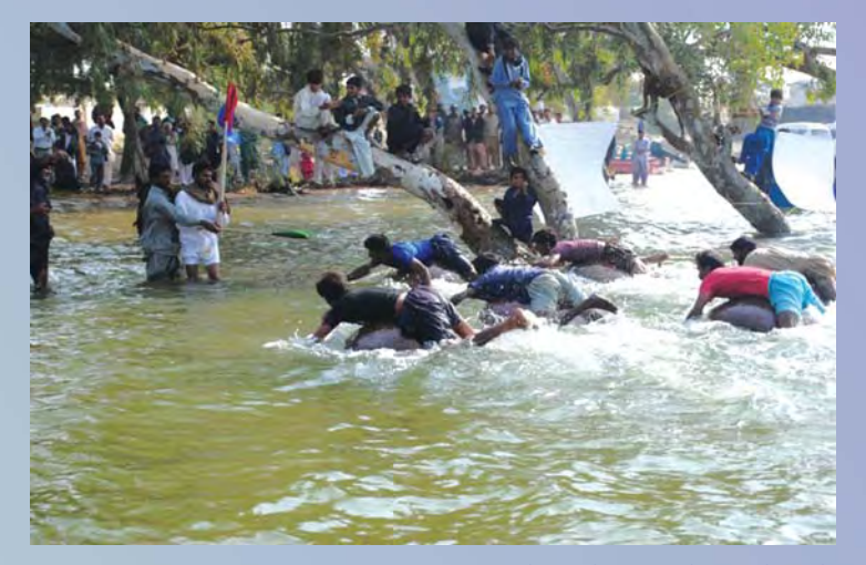
Campers participate in the Matka race in the Keenjhar Lake

A two day nature study camping was organised by the Indus for All Programme of the World Wide Fund for Nature - Pakistan on December 7, 2010 at Chul area near Keenjhar in Thatta.