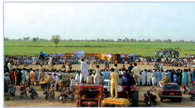
Local festival in Sanghar pulled a large crowd during the daylong event

At the start, PIU Chotiari team organized a tree plantation activity for the general public at the site and arranged 1000 saplings of local species. Before the distribution of plants, participants were sensitized about the importance and significance of trees.