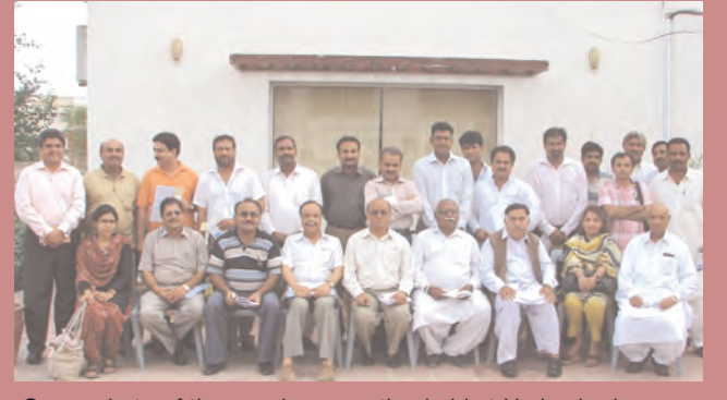
Group photo of the members meeting held at Hyderabad.